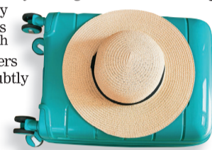
I HAVE PULL: The wheelee suitcase is a travel revolution

Now, tourists themselves are increasingly the mediators — when you photograph something and put it on your social media, you are telling people what to see and how to see it. Those photos tend to resemble earlier postcards, sketches and paintings — there's a common aesthetic between them. With phone cameras that keep improving, humans will continue vacationing, mediating that experience for others — and encouraging them to travel.