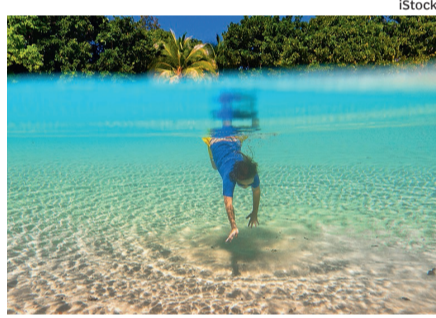
DIVE INTO NATURE: But how eco-friendly is this?

■ During the 18 th century, people began re-imagining the natural world and what was desirable to look at. Places previously off-limits or thought 'scary', like mountains and beaches, were now reimagined as wonderful. The idea spread of the 'sublime and beautiful', where the 'sublime' quickens your pulse and the 'beautiful', personified by rolling hills and pastures, was soothing. People increasingly imagined when they went into nature, they were improving their health. After 1750, 'grand tourists' still went to cities but started adding natural places as well. That was also when the idea grew that nature could be 'assisted' in the process of consuming it — it could be made more attractive.