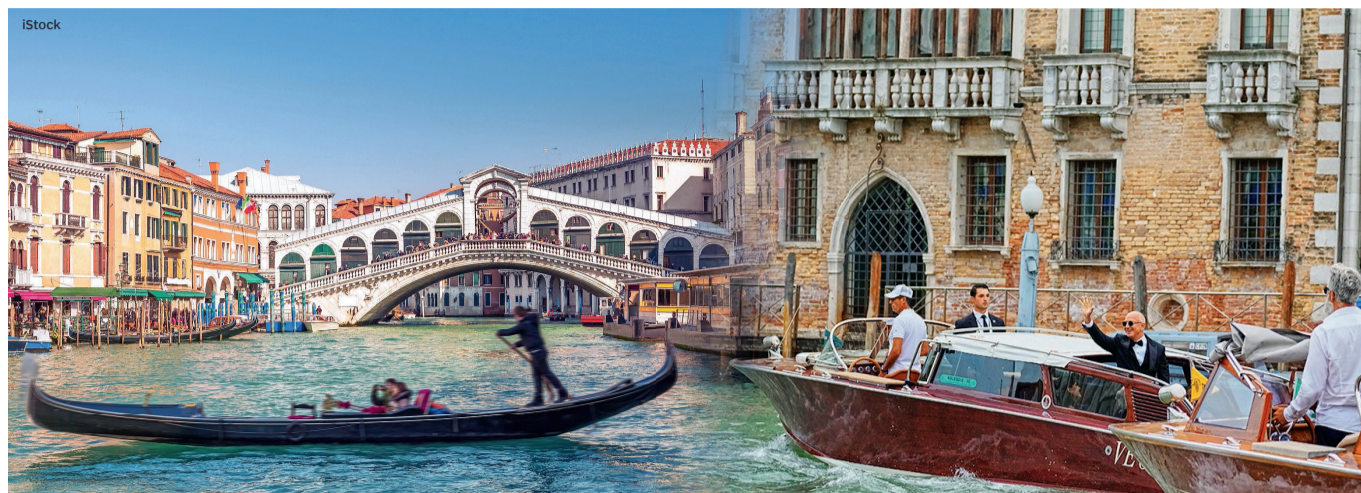
NEW MERCHANTS OF VENICE? Receiving 20 million tourists a year, Venice, which faces rising sea levels, just saw Jeff Bezos' wedding, a 'destination' event attended by the US elite and opposed by residents who feel the tourist industry is now drowning the city with crowds, noise — and inflation

Hence, 19 th century designers even tried to make Niagara Falls look 'more natural'.