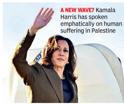
A NEW WAVE? Kamala Harris has spoken emphatically on human suffering in Palestine

Historical issues are ever-present, deep and complex. The main issue here is the status of the Palestinian people — they have no political rights. The ICJ recently ruled that Israel's occupation of Palestinian lands in the West Bank and East Jerusalem since June, 1967 is a violation of international law.