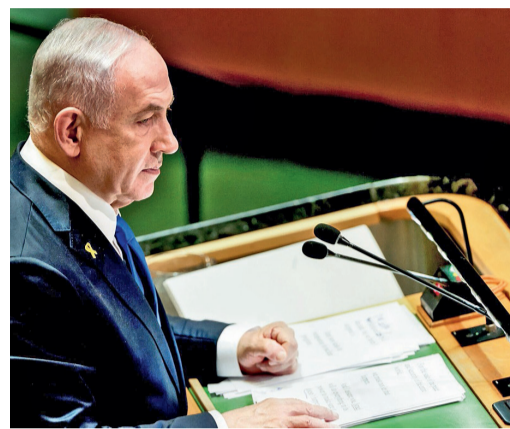
ONCE, I HAD A SCHOOL... Palestinian children have been the most grinding victims of Israel's war on Hamas. As Benjamin Netanyahu (L) vows victory, thousands have been bombed or made refugees

US politics has been driven by several considerations. First, following the Holocaust